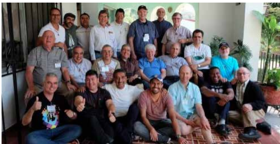
The participants of the First Pan American Assembly in Cuernavaca, Mexico, February 2016.

We feel, on that matter, the historic responsibility to be the first co-workers with this Pastor who